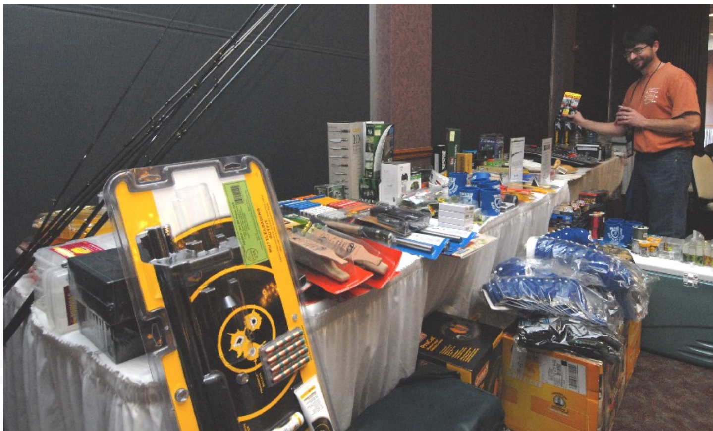
The Outdoor Writer's Raffle... Look at all the stuff!!

HOW members who didn't attend the conference this year missed out on some spectacular prizes. Besides scores of great prizes like waterproof binoculars, fishing rods/reels, turkey calls, hunting knives, muzzleloaders, camp stoves, tents, tackleboxes, archery equipment, fishing lures and spotting scopes (just to name a few items), we had a couple of extra-special prizes. Top prizes included a Remington Model 700 SPS Varmint .223 rifle and a 4-night, 3-day fishing trip for two to Ninilchik, Alaska!