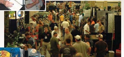
QDMA's Whitetail Expo