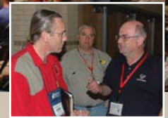
Interviews and story leads.