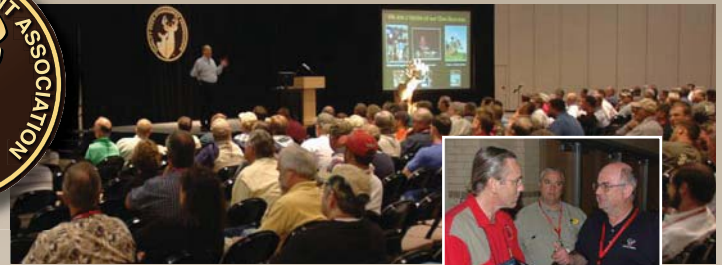
Seminars by leading deer experts.