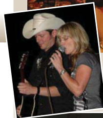
Evening events and entertainment!